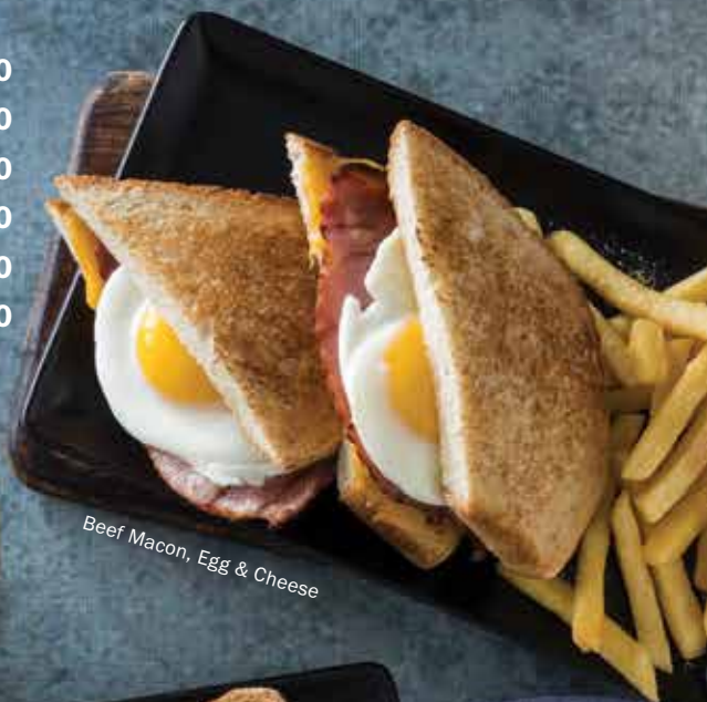
Beef Macon, Egg & Cheese