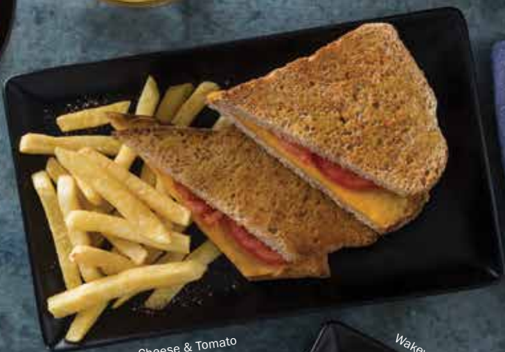
Tangy Cheese & Tomato