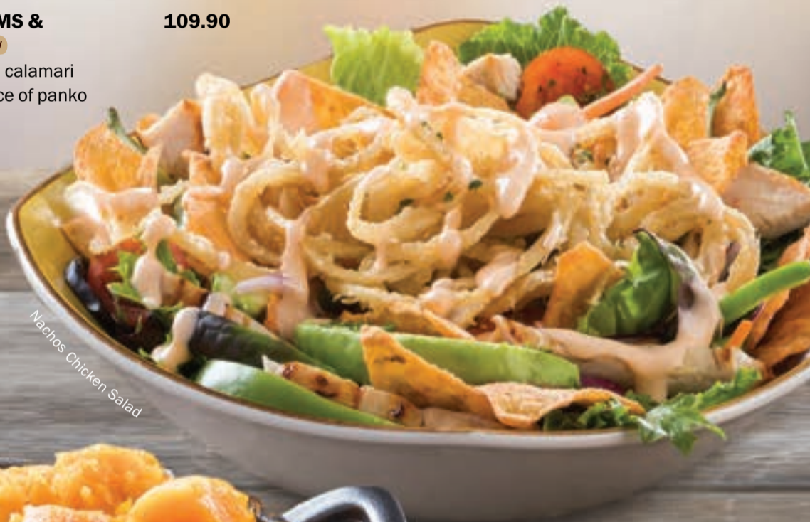
Nachos Chicken Salad

FRESH HOT VEG V 27.90 Ask about the available selection of hot veg.