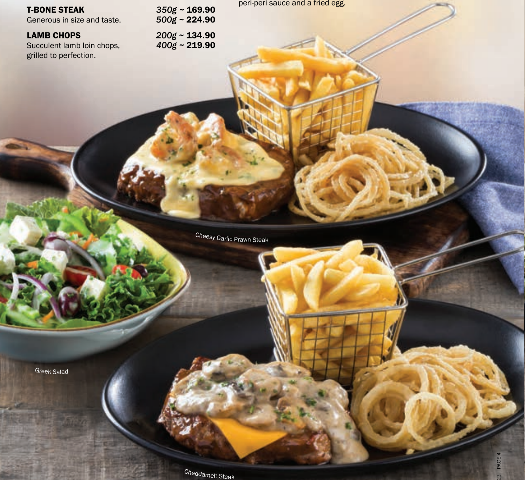
Cheesy Garlic Prawn Steak

Rump OR sirloin topped with peri-peri sauce and a fried egg.