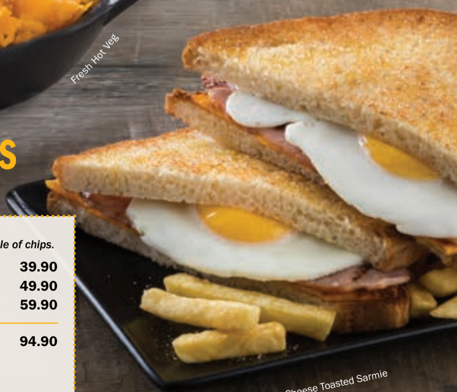
Bacon, Egg & Cheese Toasted Sarmie