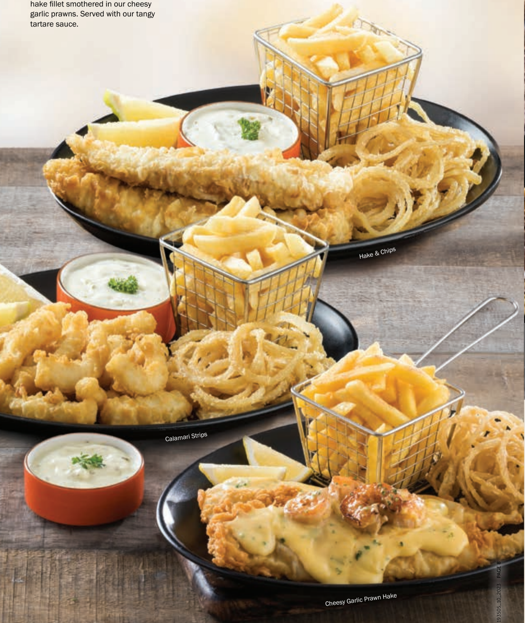
Hake & Chips