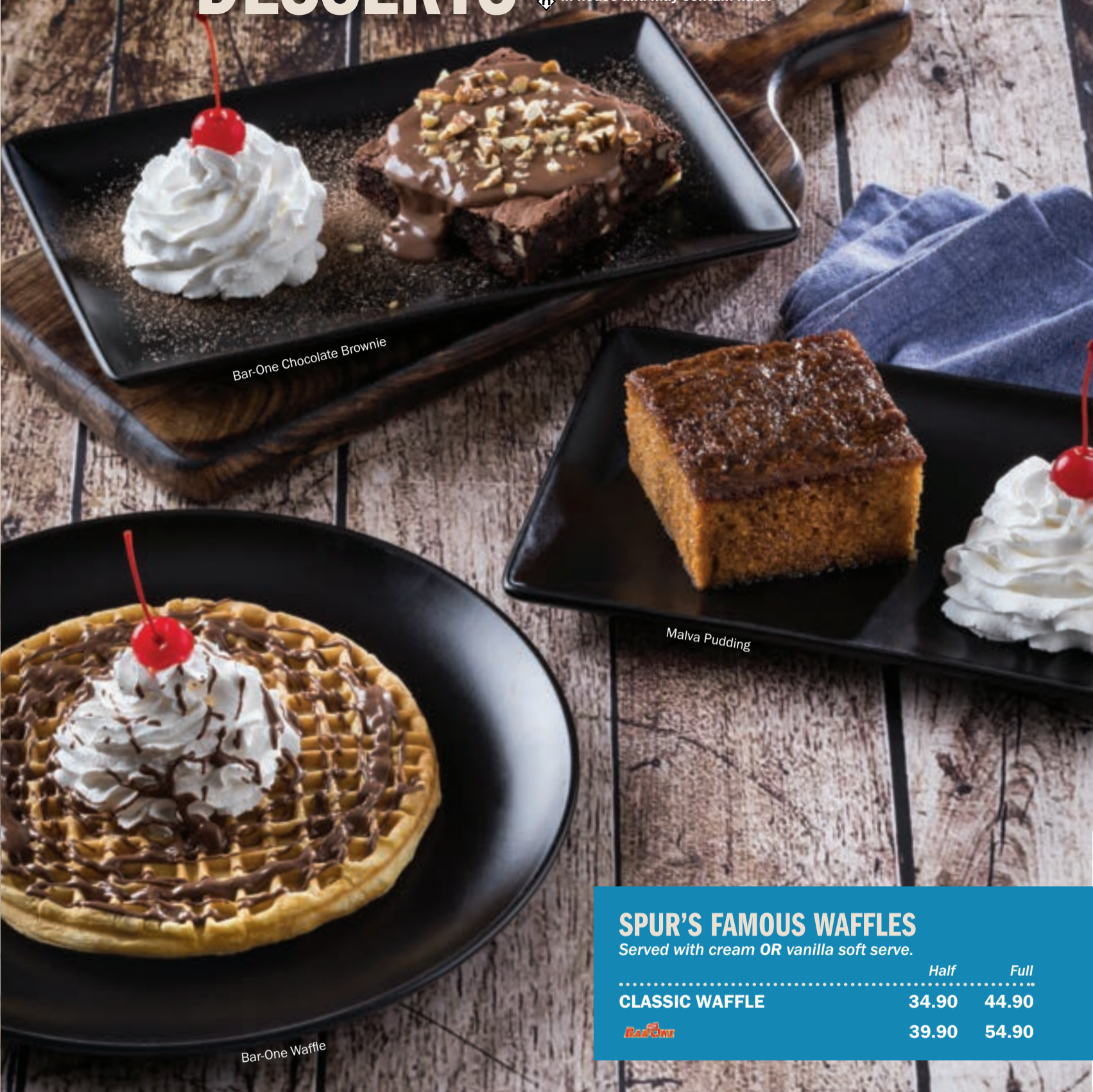
Bar-One Chocolate Brownie

! ALLERGENS: Our desserts are made in-house and may contain nuts.