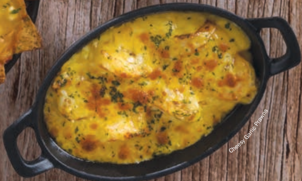
Cheesy Garlic Prawns