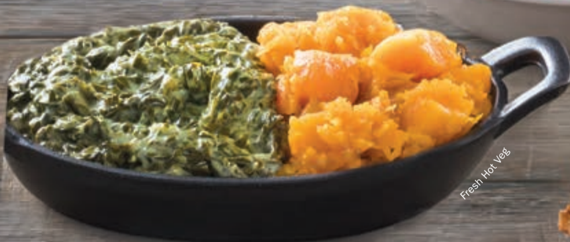
Fresh Hot Veg