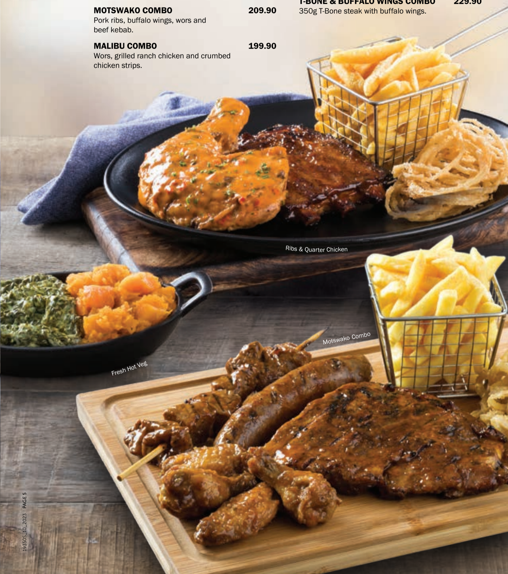
Ribs & Quarter Chicken