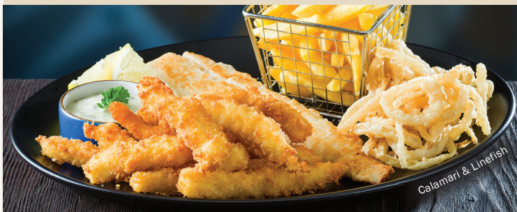
Calamari & Linefish