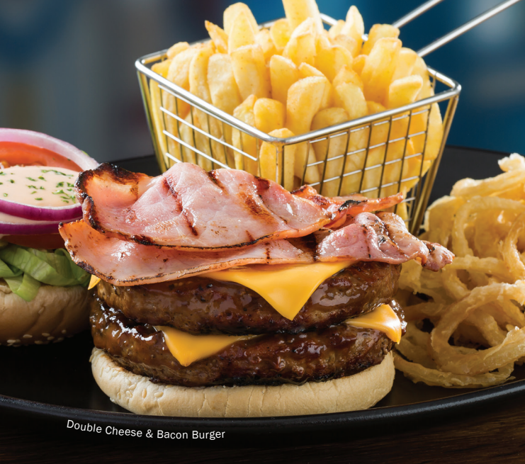
Double Cheese & Bacon Burger